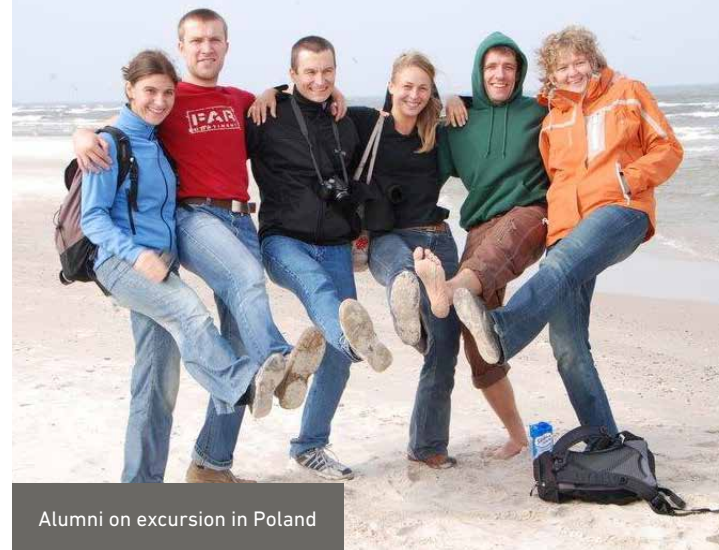
Alumni on excursion in Poland

During the fellowship practical solutions for current environmental issues are developed. After their stay in Germany the alumni are well qualified to tackle these issues in their home countries thus assuring efficient knowledge transfer. Working closely together in an international context helps to breakdown existing barriers. The acquired contacts will create a strong network of highly committed environmental experts.