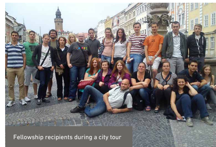
Fellowship recipients during a city tour