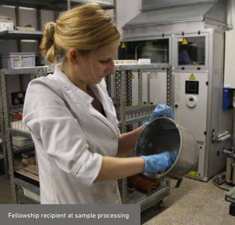
Fellowship recipient at sample processing