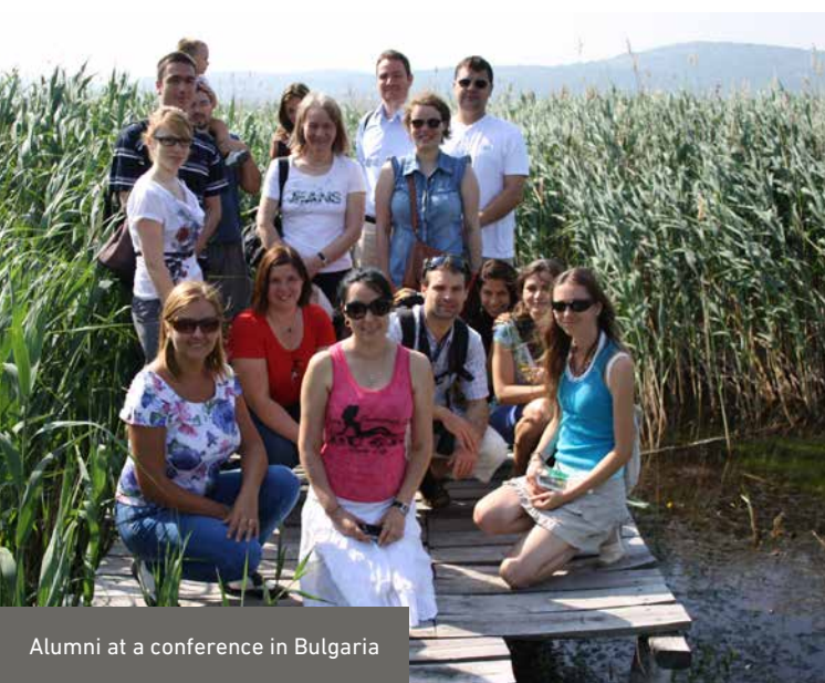
Alumni at a conference in Bulgaria

DBU coaches its fellows during the whole stay. During seminars the fellowship recipients can present their topics and their results and network with each other. Furthermore, DBU welcomes and supports individual initiatives to organize further professional events and seminars.