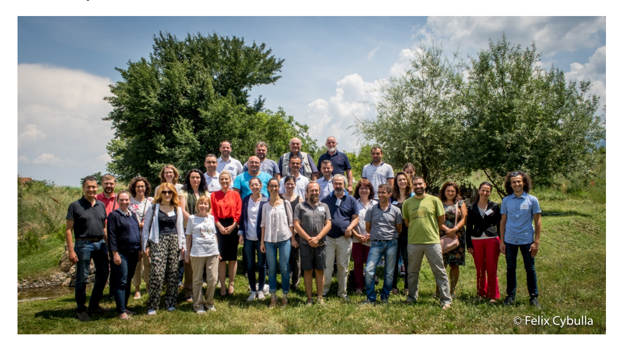
Fig. 1 Participants of the Balkan Green Belt Regional Conference 2018

During the whole project period, EuroNatur as regional coordinator of the Balkan Green Belt was in regular contact and exchange with representatives of governmental institutions of all countries, i.e. the respective Ministries of Environment and protected area management bodies, and other key stakeholders.