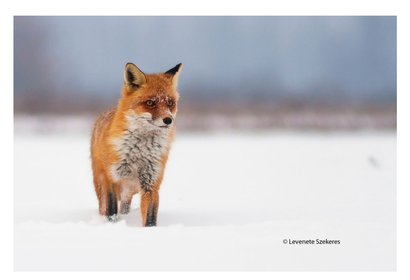
Fig. 2: Fox in the Snow, Serbia -1<sup>st</sup> place of the International Balkan Green Belt photo contest 2017

It was decided to not implement the photo contest in 2018, because the implementation is time consuming and a good number of great pictures were already collected. All partners assessed the communication tool "photo contest" a very useful one, but also identified the need for a development of a strategy for the implementation of the Balkan Green Belt photo contest, in order to make it more successful. The plan is to integrate the photo contest as a tool in the communication concept of the European Green Belt initiative. The project made it possible to initiate the first photo contests and to introduce this tool to the partners along the Balkan Green Belt.