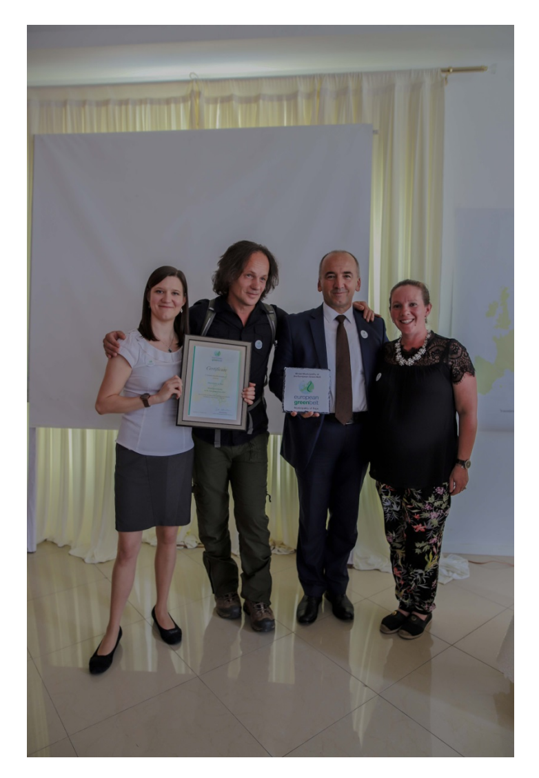
Fig. 3 Awarding of the municipality Peja as "Model municipality at the European Green Belt"

In addition the events help to support and strengthen the involved communities in their efforts and commitment for nature protection. For example during the European Green Belt Day in 2018 the municipality Peja in Kosovo was awarded as "Model municipality at the European Green Belt" by the European Green Belt Association especially due to their outstanding efforts and success in preventing the construction of unsustainable and environmentally-damaging hydropower plants in a protected area, specifically in the National Park Bjeshket e Nemuna.