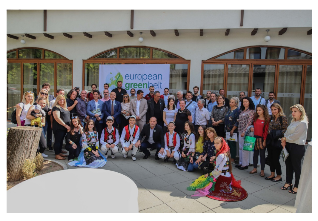
Fig. 4: Group picture during the European Green Belt Days 2018 in Peja, Kosovo

Moreover the digital newsletter of the European Green Belt Association, the website of the European Green Belt Initiative (<u>www.europeangreenbelt.org</u>) and the European Green Belt chat on facebook (<u>https://www.facebook.com/groups/377893754872/</u>) were used to inform the community of the European Green Belt Initiative about activities and results of the project. In addition, the project activities and results were regularly presented to the community in the frame of meetings and conferences.